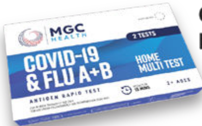
COVID Home Test