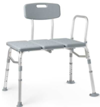
ADJUSTABLE HEIGHT 15.5" - 22.5"