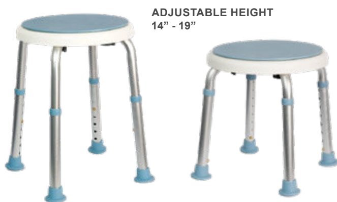
ADJUSTABLE HEIGHT 14" - 19"