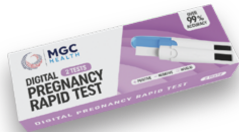
Pregnancy & Ovulation Home Tests