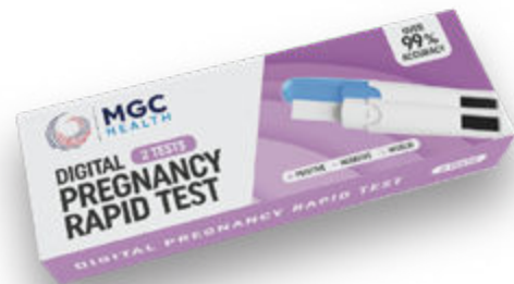
Pregnancy & Ovulation Home Tests