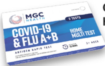
COVID Home Test