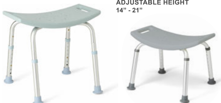
ADJUSTABLE HEIGHT 14" - 21"