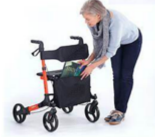
Convenient shopping bag