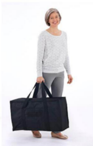
Practical storage bag for transportation